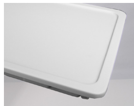
No drip edge

Features a variety of heavy duty powder coated metal base options, a pneumatic cylinder with infinite height adjustment within a height range of 27.5" to 42", lockable casters and optional storage.