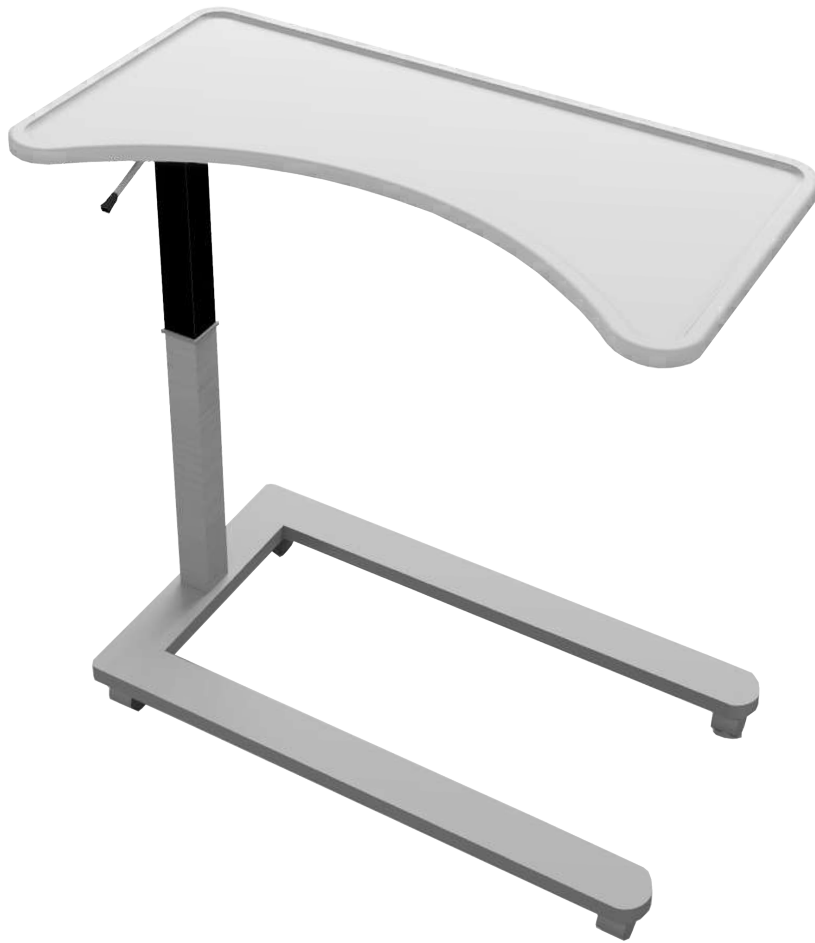
FUTRUS ® GUARDIAN OVERBED TABLE