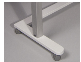
Powder coated base