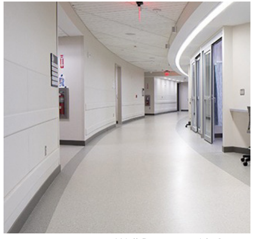
Wall Bumpers with Corian® Walls

For complete product specifications, visit futrus.com.