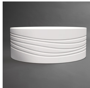
• Elipz Table with Waves Texture Example