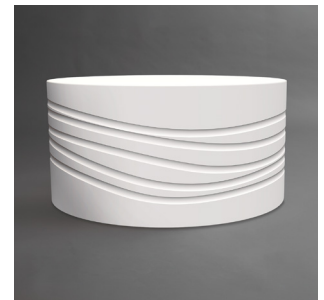
• Ovee Table with Waves Texture Example