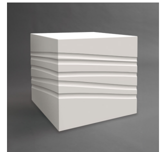
• Kubi Table with Waves Texture Example