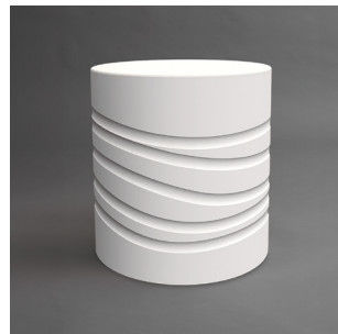
• Cirko Table with Waves Texture Example

For complete product specifications see spec sheet