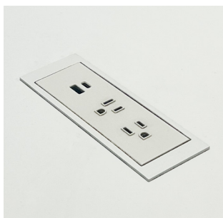
• Power Grommet integration