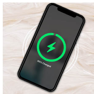
• Wireless Charging Integration