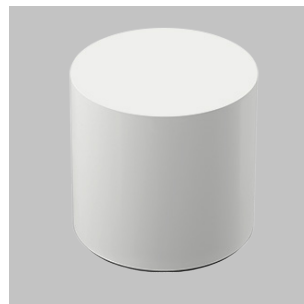
• Cirko Table

For complete product specifications see spec sheet