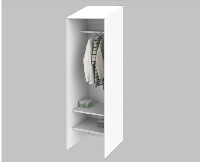
Futrus Sereniti Shelving System Wardrobe Example