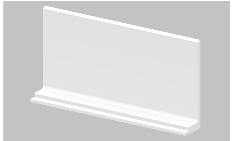
• Halo Cove Floor Trim