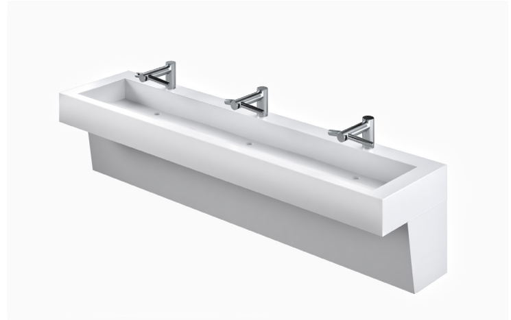
• AquaDRI Trough Sink Module With Hand Dryers