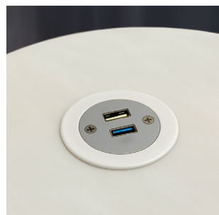
• Power Grommet integration