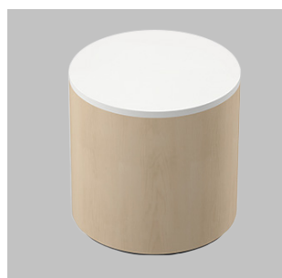
• Hybrid Cirko Table

For complete product specifications see spec sheet