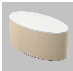
• Hybrid Elipz Table