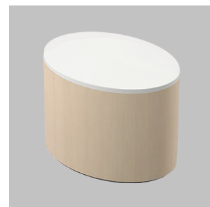
• Hybrid Ovee Table