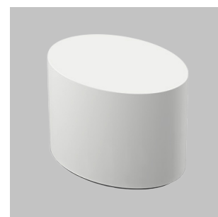
• Ovee Table