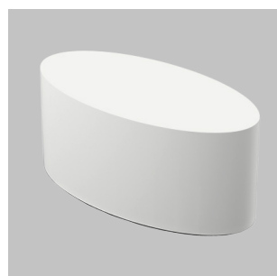
• Elipz Table