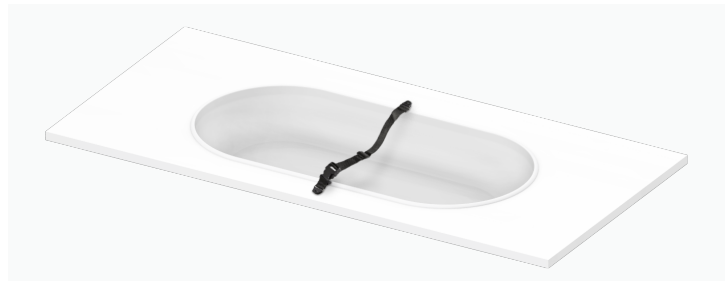
• Recessed Kradel