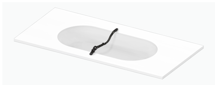
• Integrated Undermount Kradel