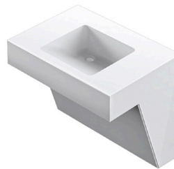
• AngleX Module

For complete product specifications visit futrus.com