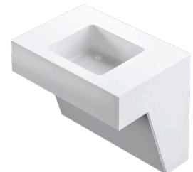
• Cubica Module