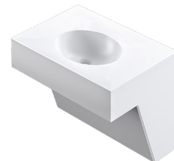
• Elipta Module